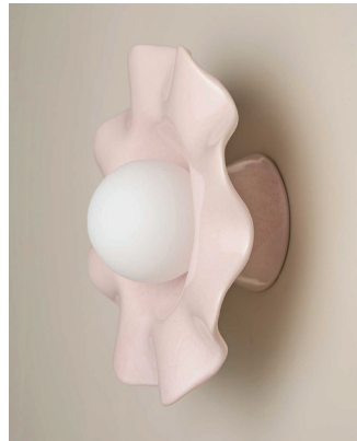
225403 ROSE QUARTZ (ONLINE EXCLUSIVE)

Due to the nature of clay and our manufacturing process, variations on shade, colour, and size are a natural feature of ceramic product fired at high temperature.