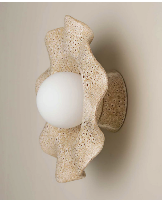
225402 WHITE OCHRE